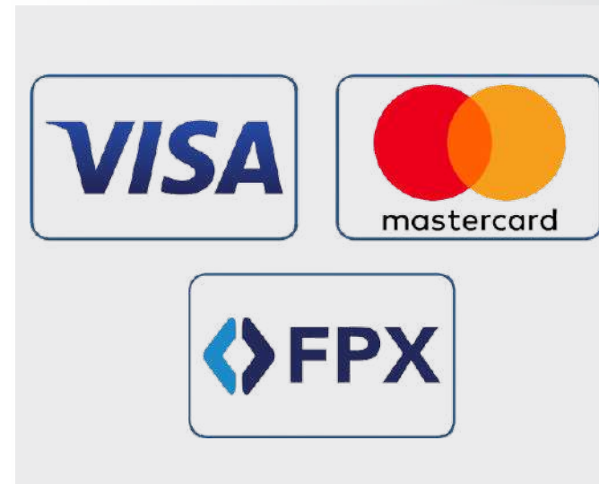
Visa, Mastercard and FPX, safe and stable payment method