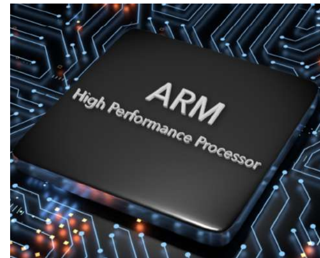
High-speed processor, first-class performance

The 5.5-inch IPS capacitive full HD screen displays important information utmost precision and offers an error-free use experience.